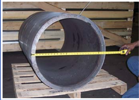
1-1/2" plate 45" long rolled to a 24" inside diameter

Let us curve your angle, bar, beam, channel, tube, tee, rail, pipe, sheet and plate.