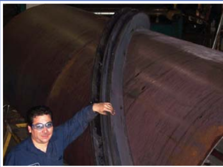
Helical strakes verified on custom rolled plate simulating the stack