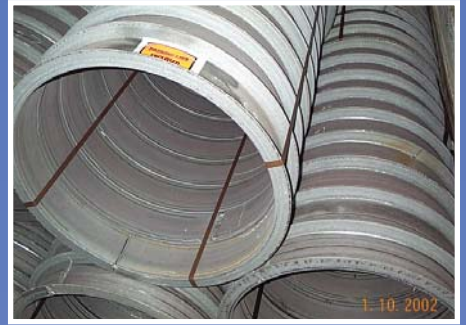
Flanges out channel rings