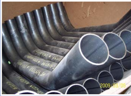
4" pipe with two bends trimmed to length