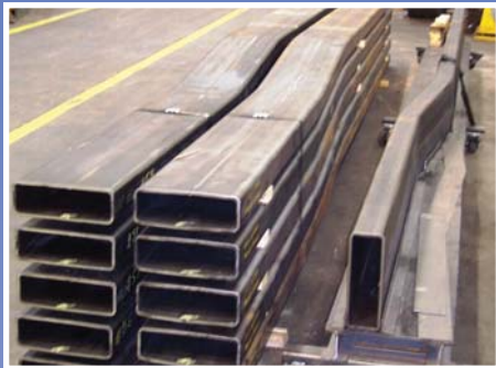
12 x 4 x 5/16 tubes bent and cut