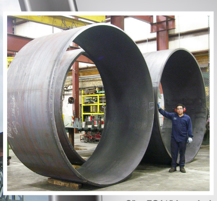
2" x 58½" beveled plate rolled to a 128" outside diameter

5/16" plate cone with a 16" minor diameter and a 48" major diameter with an overall height of 42"