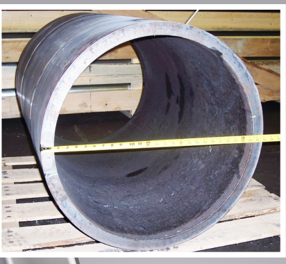
1½" plate 45" long rolled to a 25" inside diameter