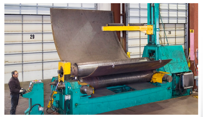
2" x 12' plate roll can roll 40ft lengths

Chicago Metal Rolled Products accurately curves metal into cylinders, segments and cones up to 3\frac{1}{4} " thick x 10' wide x 40' long plate. On our largest machines we can also roll 12" thick x 36" wide. 3-day, 2-day, 1-day and same-day turnaround times.